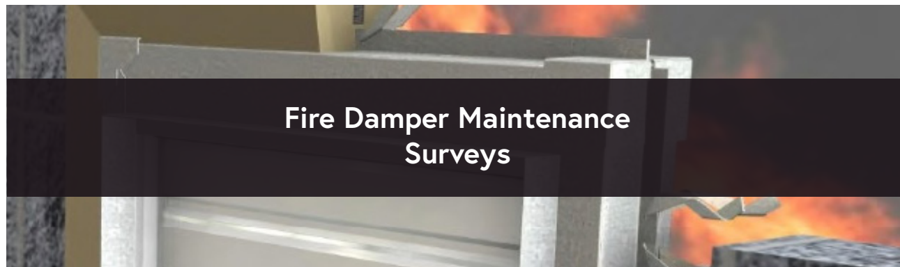
Fire Damper Maintenance Surveys