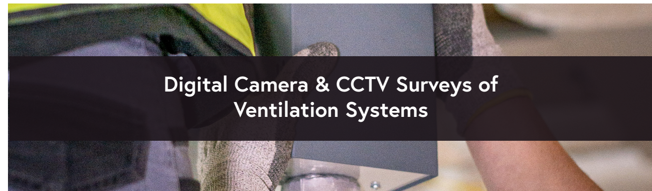
Digital Camera & CCTV Surveys of Ventilation Systems

Have peace of mind and a professional job achieved call the Air Clean Specialists - Imperial Hygiene Solutions