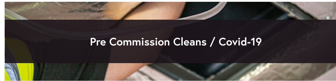
Pre Commission Cleans / Covid-19