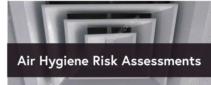
Air Hygiene Risk Assessments