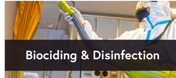
Biociding & Disinfection