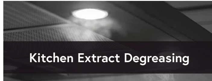
Kitchen Extract Degreasing